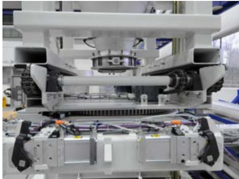
Change of the container travel direction on the turntable