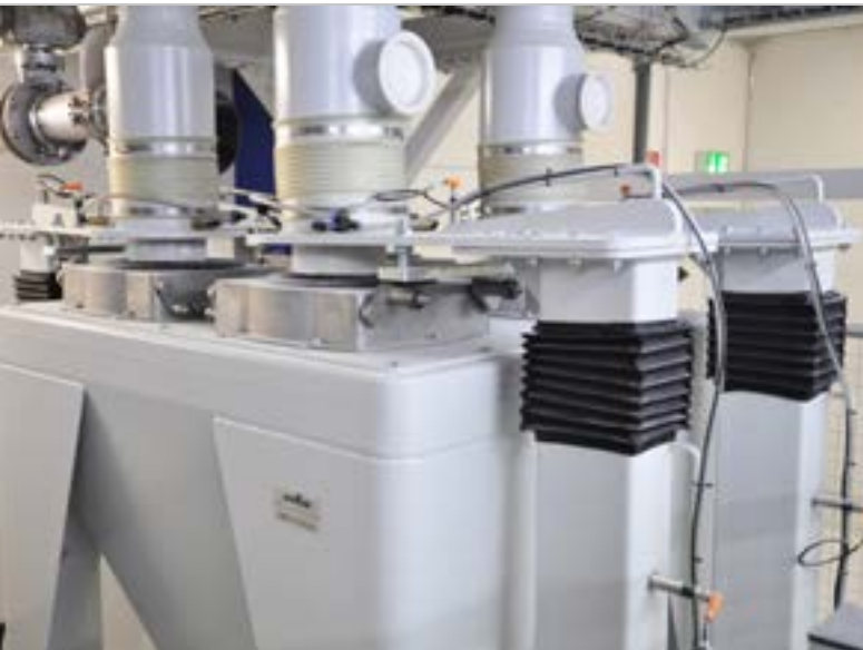
Dust-free docking to the container with scale decoupling