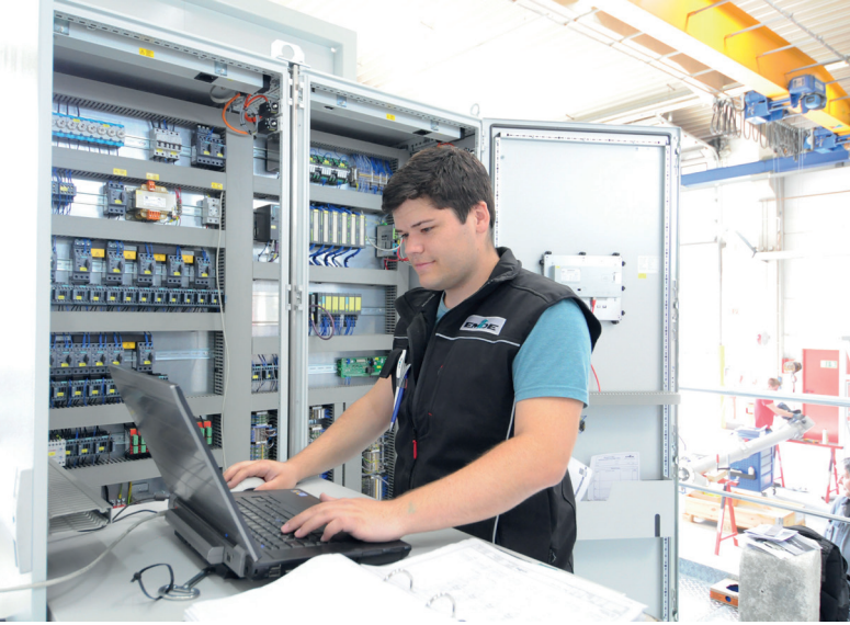
Increase equipment availability with qualified EMDE Service staff