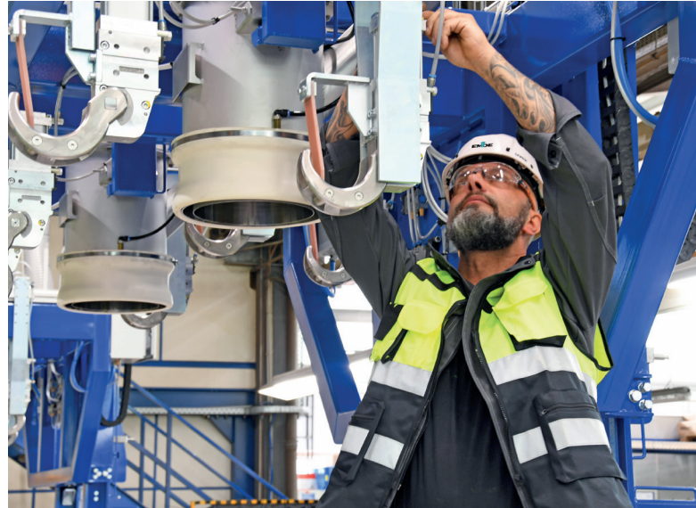
Qualified service technicians